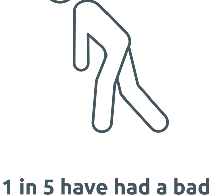
day as a result of inadequate washroom facilities.